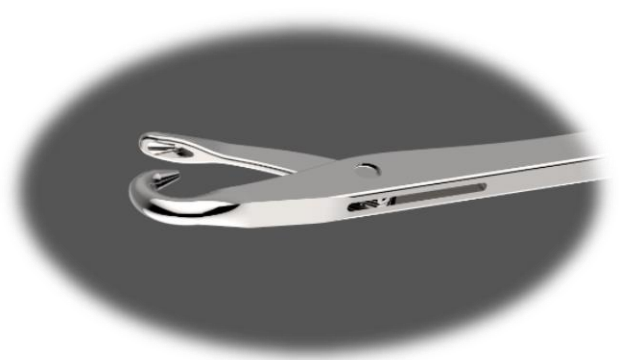
Single Jersey needles of the highest quality

The qualities that have contributed to the well-established good image of KERN-LIEBERS Textile for decades have now also been demonstrated for needle production. Uncompromising high-end quality for the steadily growing demands of the global textile market.